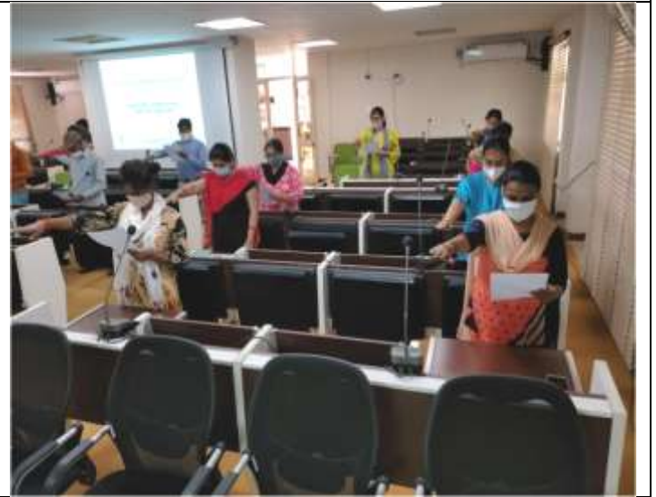
Activities during Vigilance Awareness Week at ICAR-ATARI Jabalpur