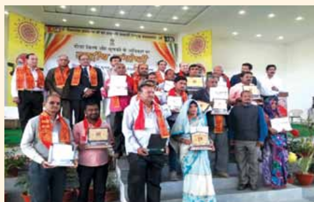
Awardee Farmers with Chief Guest and Dignitaries