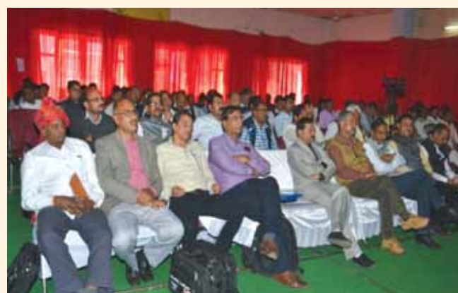
Delegates of the workshop