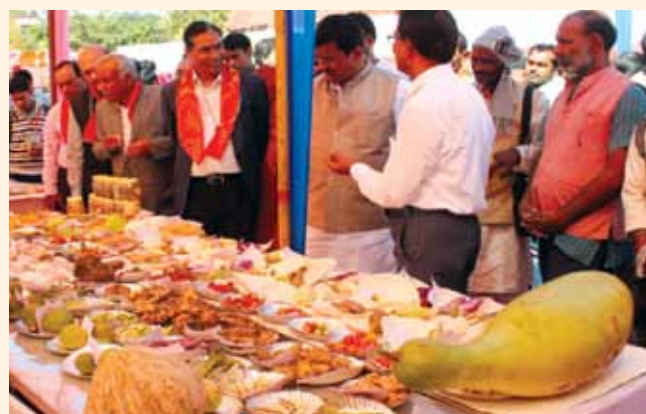
Secretary DARE & DG, ICAR visiting the Exhibition stalls